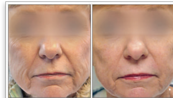
4 Weeks Post 1 Treatment