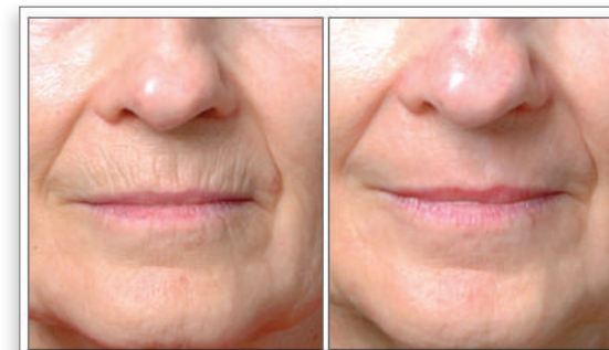
4 Months Post 1 Treatment