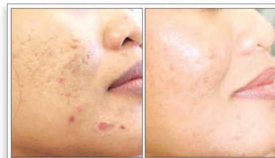
Post 3 Treatments